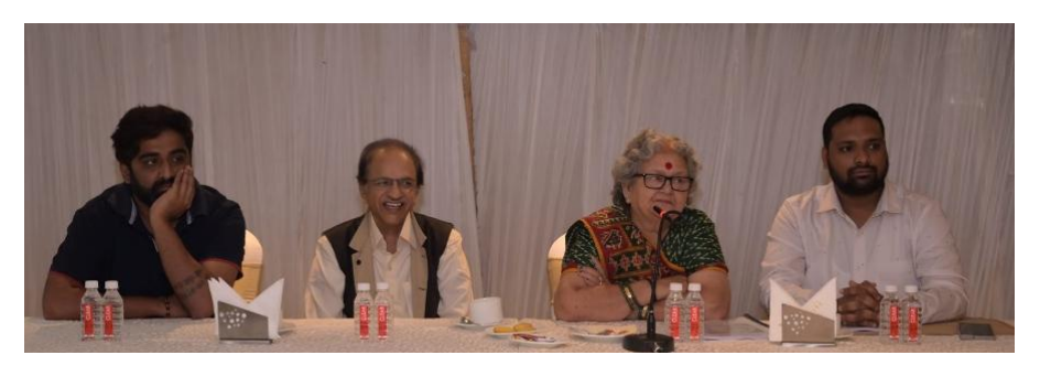
Honourable Mayor of Kanpur Municipal Corporation with Praja and Ekjut Kanpuria team

Apart from the UPMCA and Municipal Finance, the workshop also focused on the three-tier system of Governance, 74<sup>th</sup> Constitution Amendment Act, various Committees in a city, roles and responsibilities of a Councillor and deliberation at local level. It also aimed to facilitate networking and collaboration among the councillors.