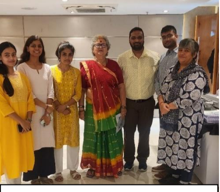
Praja Team with Mayor of KMC