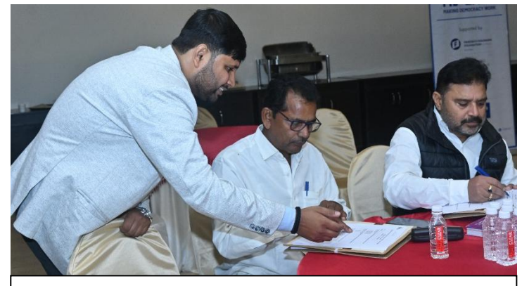
Praja Team engaging with Councillors in Varanasi Workshop