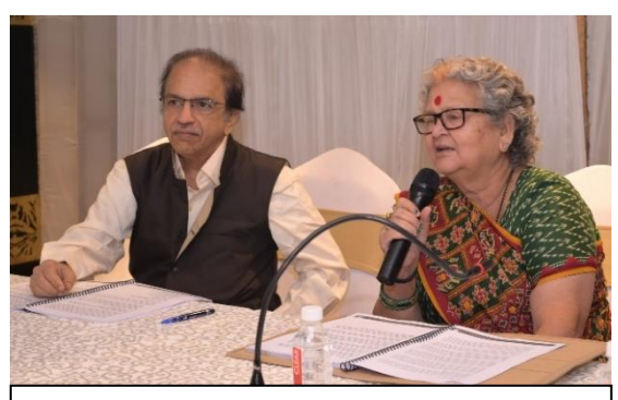
Mayor of KMC addressing the Councillors