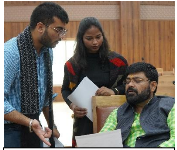
Praja Fellows and councillors in Gorakhpur