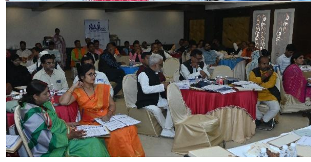
Councillors during the session in Varanasi